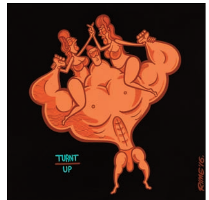
RIME , Turnt Up , 2016, acrylic on wood, 8" x 8"