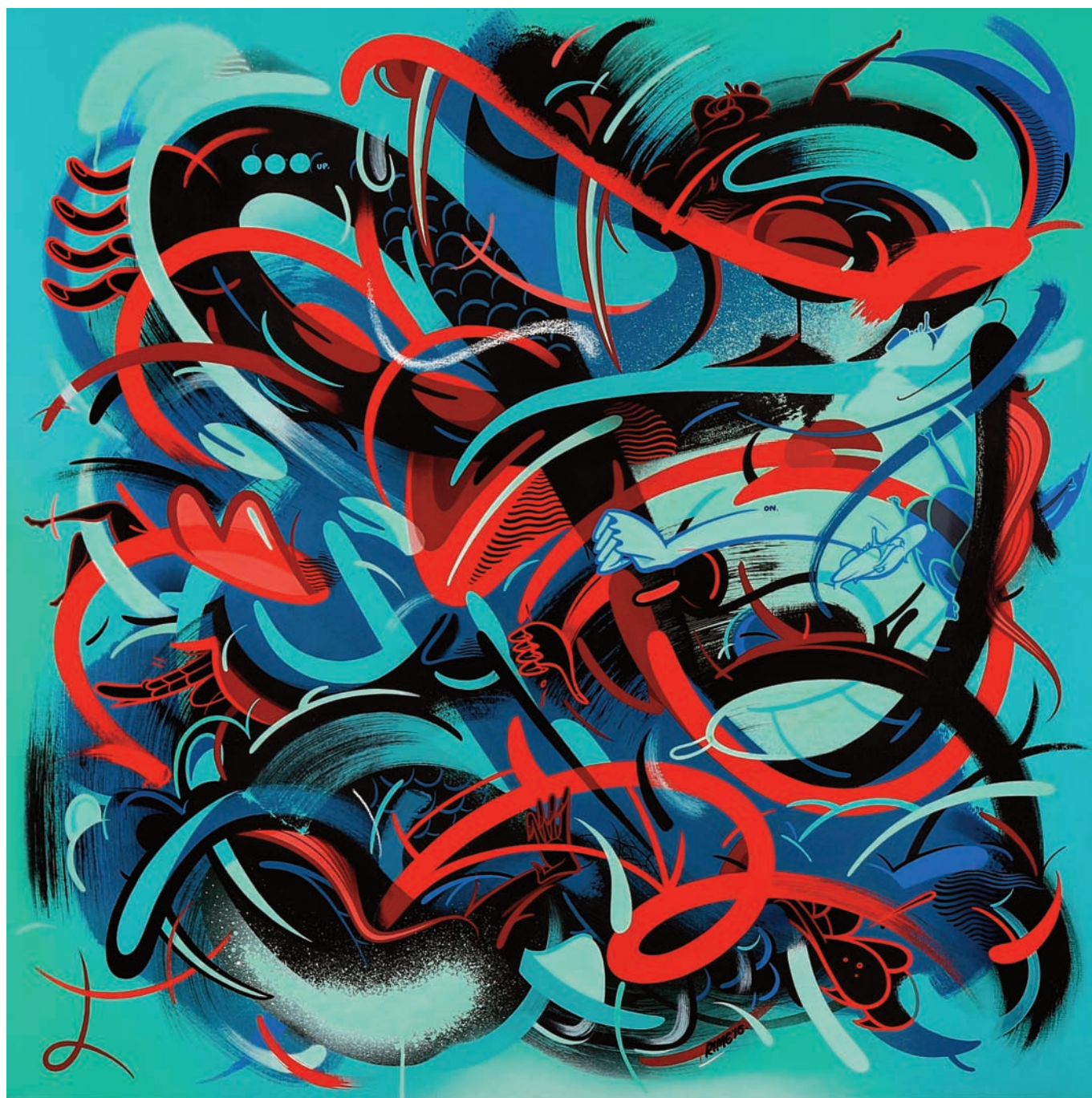
RIME , Up on Through , 2016, acrylic and oil stick on canvas, 40" x 40"

His two dimensional works seem to lunge from the wall, as much from their fluid lines and forms as by their richly abundant details, so that the eye can constantly discover previously unsuspected aspects. As with a vaguely familiar tune that suddenly assumes its meaning, Rime's creations can be seen, studied, and comprehended with time.